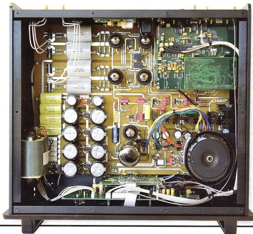
RIGHT: Based on ARC's DAC8 with a Stream Unlimited network audio solution [see boxout], the REF DAC/tube preamp includes four 6H30 double triodes, a 6550C and 6H30 in the PSU

As always with such devices that employ a small fascia-mounted screen, navigating your music collection is a bit clunky – and you'll have to sit next to the DAC in order to read the display – nevertheless with correctly tagged files it does display colour thumbnails of album artwork. If