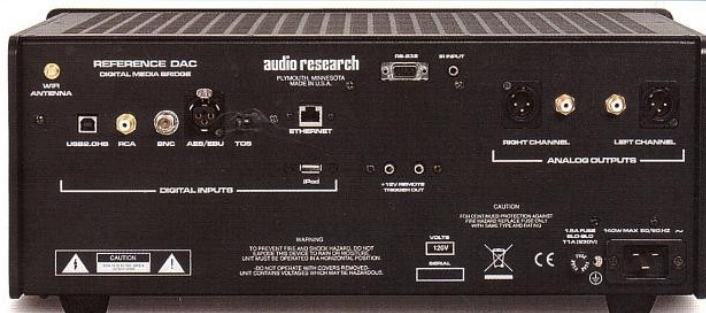
ABOVE: Balanced (XLR) and single-ended (RCA) analogue outputs are joined by USB, three S/PDIF and one AES/EBU digital input plus wired (and wireless) ethernet hubs

from one of Reference Recording's 24-bit/176.4kHz 'HRx' releases entitled Thinking About Bix [RR-116] was marginally better focused and explicit without the D-to-D converter in the replay chain. The attack and decay of the piano was more sharply defined, while the space in which it had been recorded appeared better resolved. Either way, the sound was deliciously vibrant.