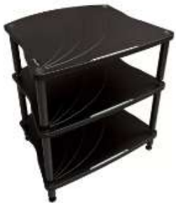
LYRA XL4 2.1