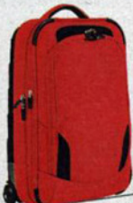
£89, Marks & Spencer