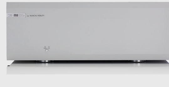
M8-S 500s | POWER AMPLIFIER

It is the true heir to the Titan, delivering near-identical quality sound, with exceptional clarity and dynamics. The M8-S 700m can create a huge soundstage that's almost holographic in its width and depth. From the most intimate acoustic recording to full-scale orchestral works, the performance is perfectly placed and never feels limited. Pair it with our matching M8-S pre-amp and you have awesome amplification fit for any system.