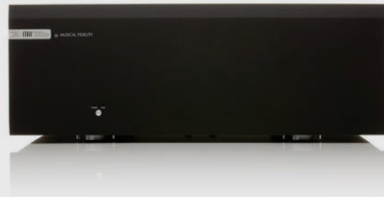
M8-S 700m | MONOBLOC POWER AMPLIFIER