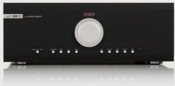
M8-S PRE | FULLY BALANCED PREAMPLIFIER

The M8-S is a pre-amplifier without limits. From its performance to its connectivity, via quality fit and finish, the M8-S makes a superlative centrepiece for almost any system.