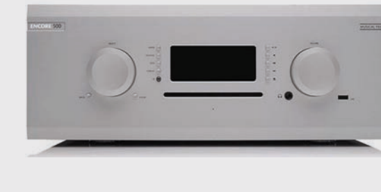
M8-S Encore 500 | STREAMING MUSIC SYSTEM

However some customers do not have the space for two large monoblocs and do not necessarily need that much power. For them we have designed the M8-500s. Pairing it with the matching M8 Preamp gives an amplification system fit of the highest levels of reproduction.