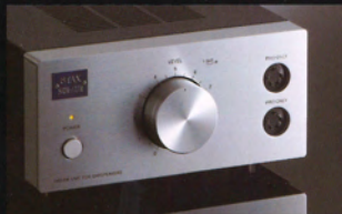
SRM-727II Driver unit for earspeaker