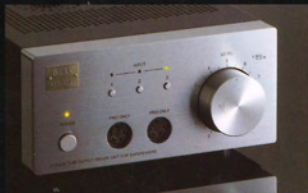
SRM-007tII Driver unit for earspeaker