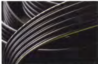
● Silver-coated high-purity copper cable of 99.9999% (6Nines)