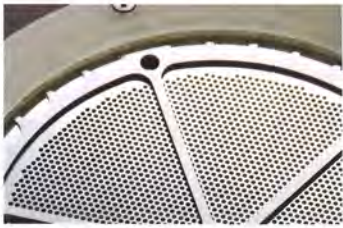
● MLER (Multi Layer ElectRodes)