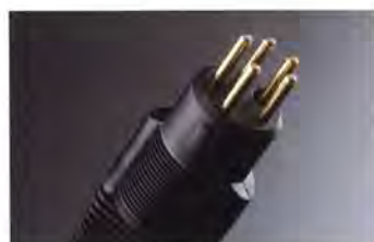
● STAX 5PIN Connector