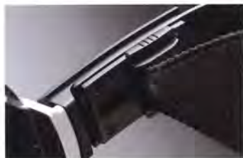
● 10-step slider