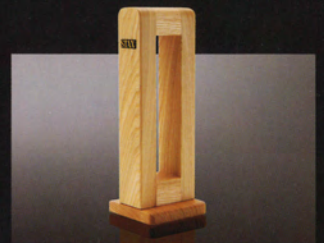
HPS-2 Earspeaker stand