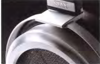
● Precise machine processing enclosure