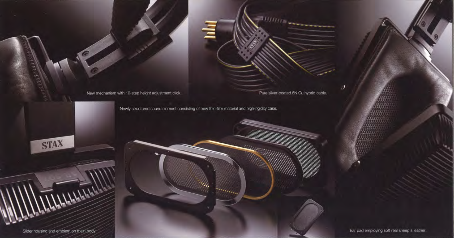
New mechanism with 10-step height adjustment click.