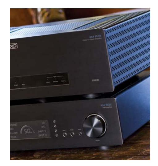
combination not only sounds incredible, but works in perfect harmony too.

The 851E and W are, of course, designed to work in perfect synergy with each other – from the fully balanced XLR audio connectivity, to neat touches such as power syncing with each other – this pre and power amplifier