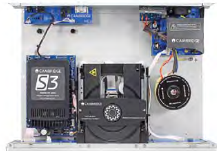
The CXC CD transport uses Cambridge's proprietary S3 servo mechanism which the company claims gives minimal jitter and excellent error correction.