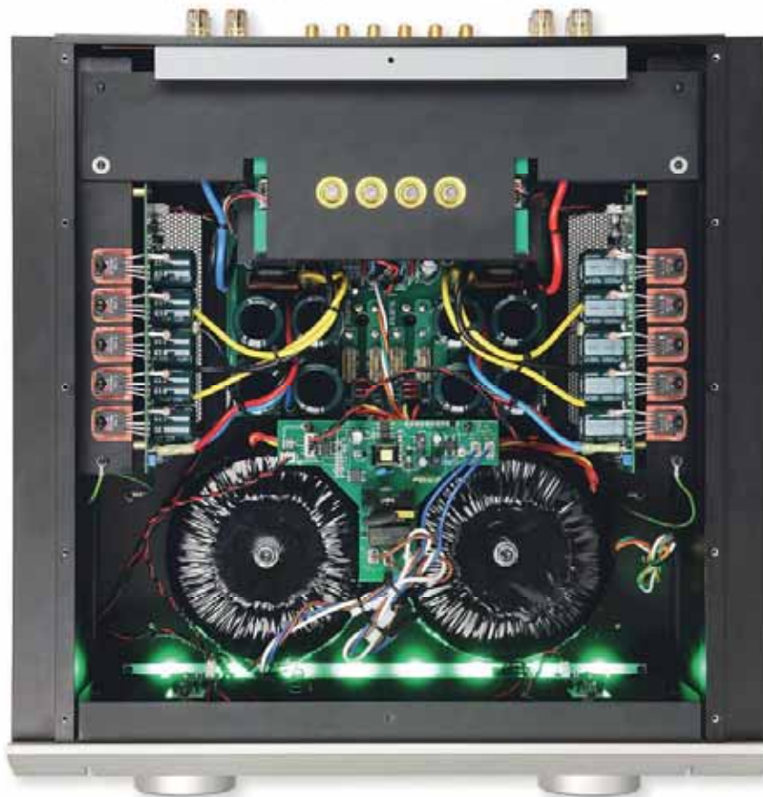
RIGHT: A pair of nuvistor triodes drive no fewer than five pairs of Sanken power transistors per channel. Note the pair of toroidal PSU transformers and dual-mono amplifier layout

Launched by RCA in 1959, the nuvistor appeared in the company's TV sets and other RF applications, but it was soon