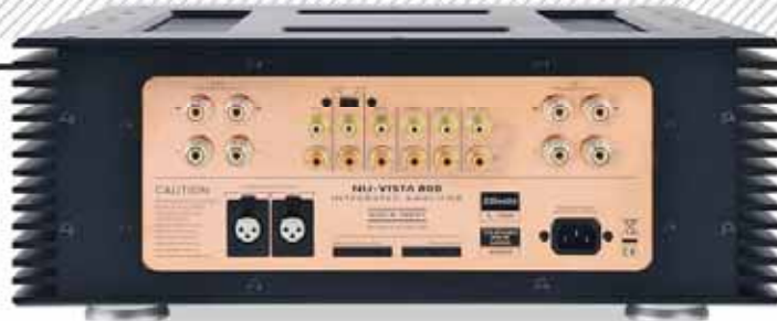
ABOVE: A delight for those who hate clutter: multi-way speaker taps paired for bi-wiring, four line inputs, one balanced input, line-out and pre-out, plus IEC mains

words, despite being voiced by a man whose idea of a pianist is Grigory Sokolov while mine is Jerry Lee Lewis, the '800 rocks.