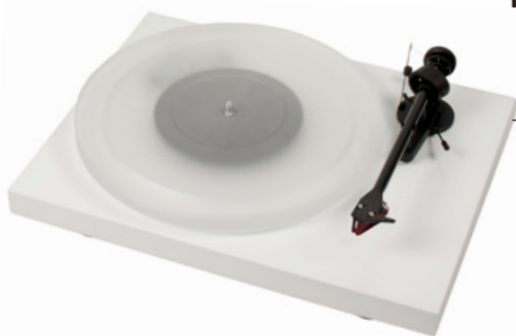
● PRO-JECT DEBUT CARBON-WHITE