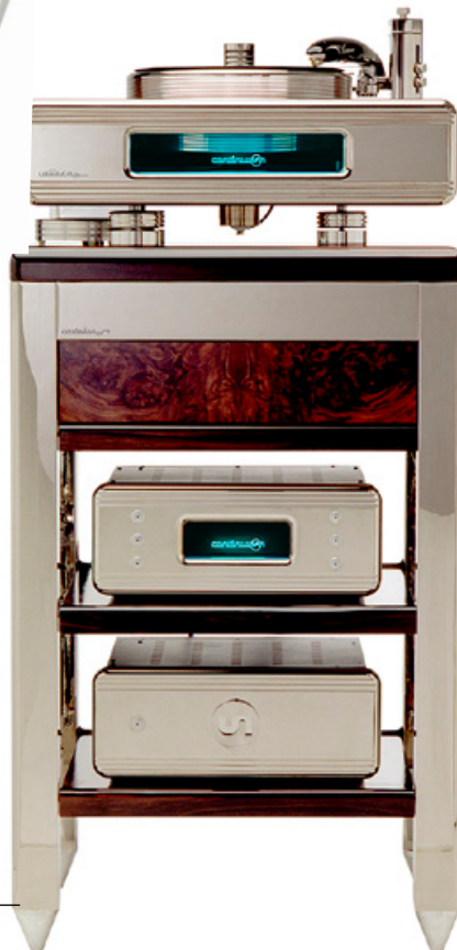
● CONTINUUM CALIBURN TURNTABLE