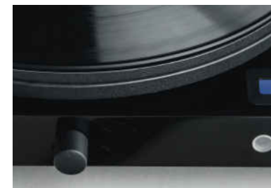
Platter: 300 mm incl. felt mat