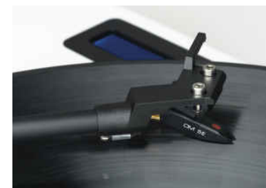
Cartridge: Ortofon OM5E