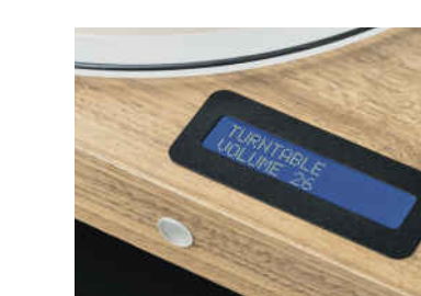
Built-in high-contrast display