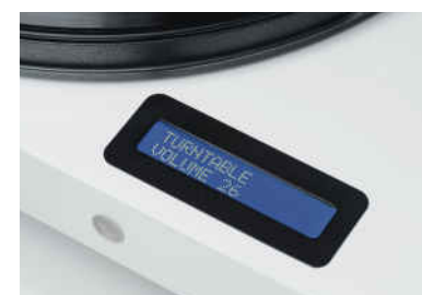
Built-in high-contrast display