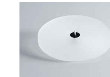
Acoustically neutral high-mass acrylic platter