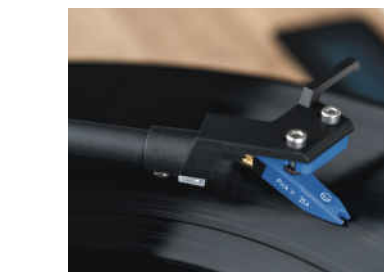
Cartridge: Pick-it 25 A